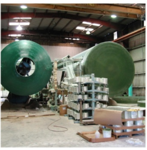
Tanks • Manholes • Wetwells • Piping Systems

5528 E. Highway 290 Giddings, Texas 78942 Phone 800.237.5791 Fax 979.542.0911 www.lfm-frp.com